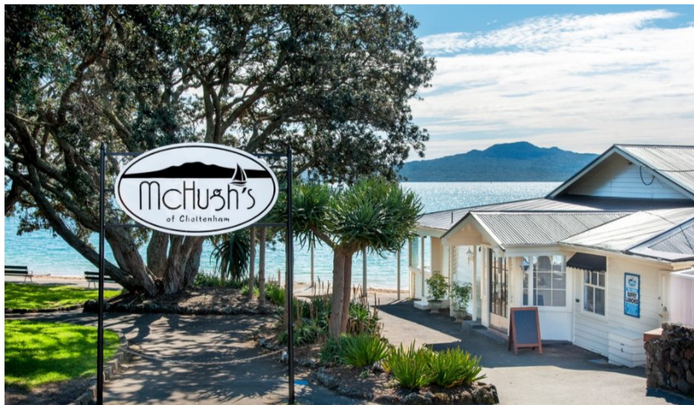
Photo of McHugh's from their Facebook page.