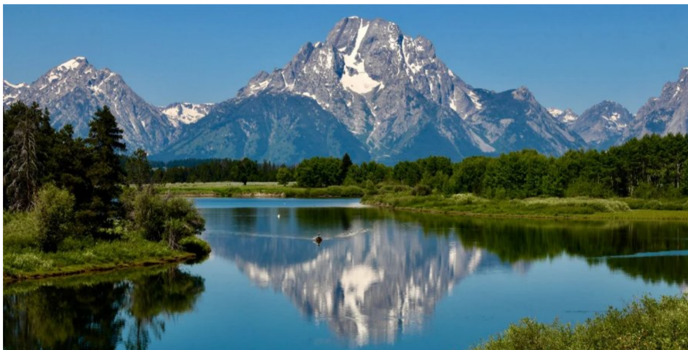
Grand Teton National Park (Wyoming)

Grand Teton National Park has a lake the size of Lake Taupo and is surrounded by mountains, most of which are higher than Mt Cook.