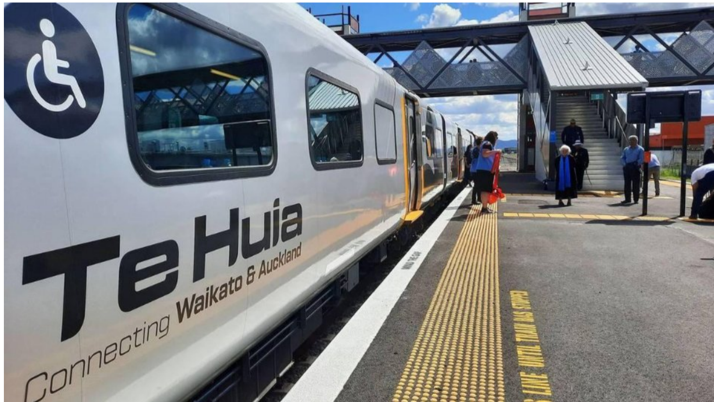
The Te Huia train stops at four stations: The Strand, Puhinui, Papakura, Huntly, Rotokauri and Frankton.