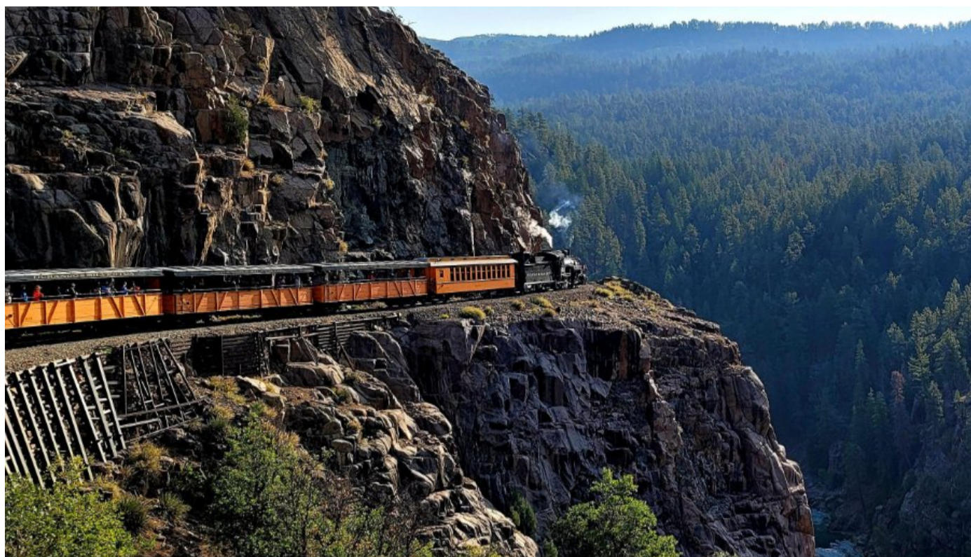
The Durango & Silverton Narrow Gauge Railroad transports passengers through the San Juan National Forest.

The San Juan National Forest in western Colorado is where the Durango and Silverton narrow-gauge railway is located. It is one of the top ten scenic railways in the world. Durango is like Queenstown because it is a beautiful place and survives on tourism.