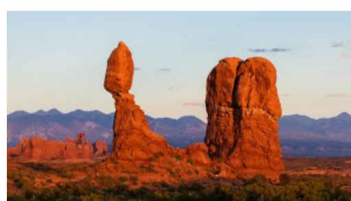
Suzanne in front of Balanced Rock in Utah. She also squeaks into the right hand corner of the room photo.